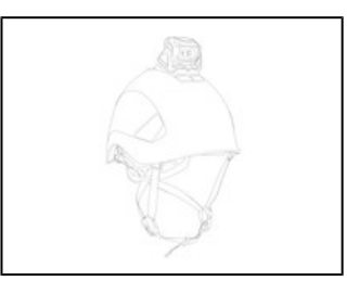
The adhesive plate can also be placed on top of the helmet, maintaining the ability to adjust the lamp's tilt.

The HELMET ADAPT adhesive plate allows you to mount a ARIA headlamp on most helmets.